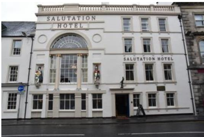
Front door of hotel on main road.