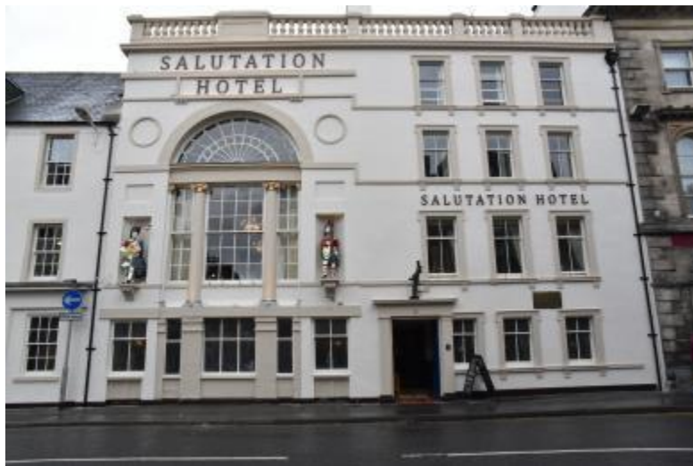
Front door of hotel on main road